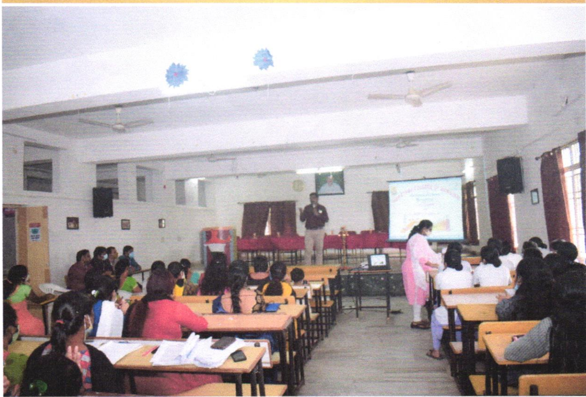
Figure 2 : Mr.Srinivasulu GM,HR ,NMCH on Career counselling programme